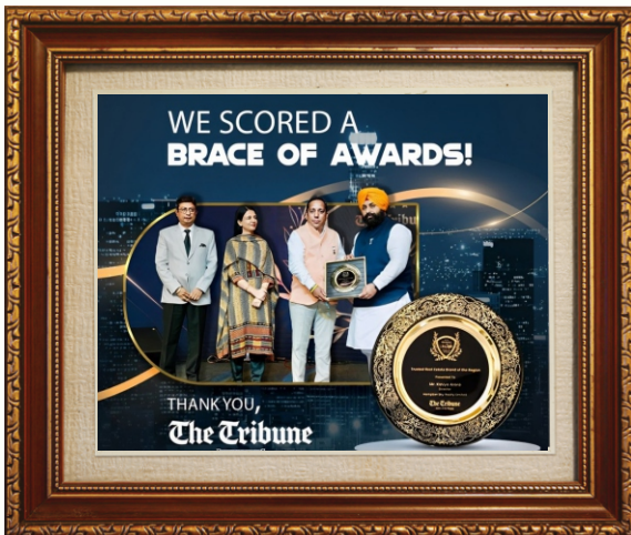
Hampton Sky Realty Limited was awarded with " The Tribune Lifestyle Awards Punjab 2024 " for trusted Real Estate Brand of the region.