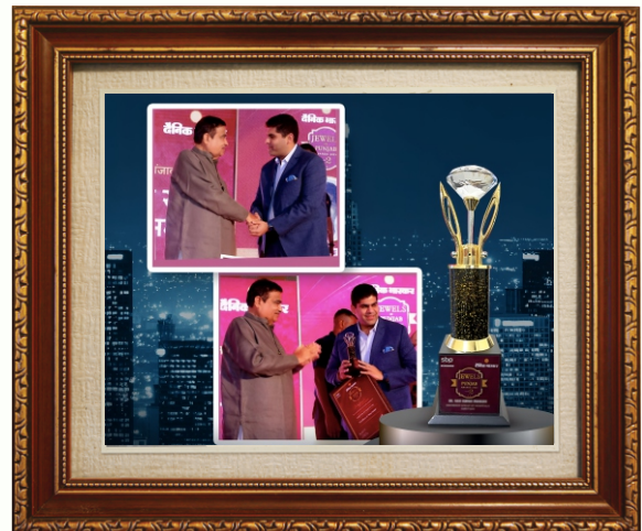
Hampton Sky Realty Limited was vouchsafed with the " Jewel of Punjab awards 2024 "