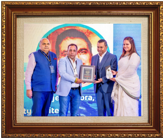
Hampton Sky Realty Limited was vouchsafed with the " Achiever Awards 2024 " for Excellence in Real Estate Development.