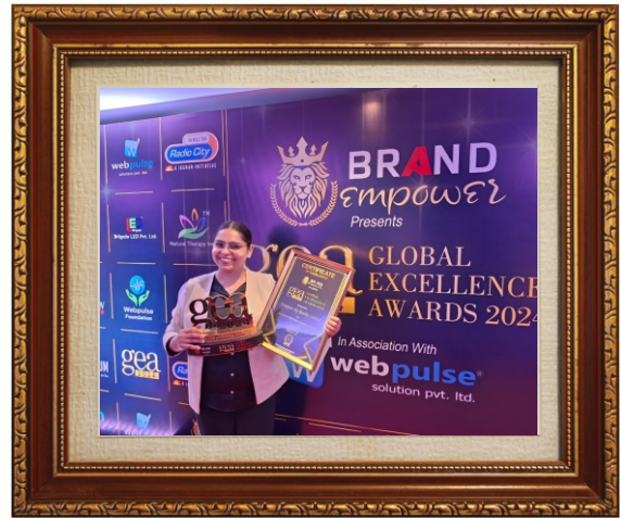
Hampton Sky Realty Limited was honored with the " Global Excellence Awards 2024 " for Most Trusted Real Estate Company in Punjab.